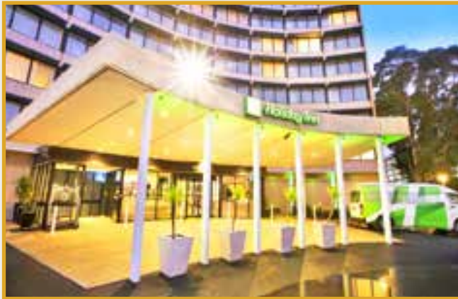
Above: Holiday Inn Melbourne Airport