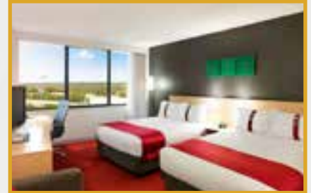
Above: Holiday Inn Melbourne Airport